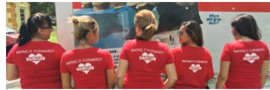
Showing off their Pay It Forward shirts.